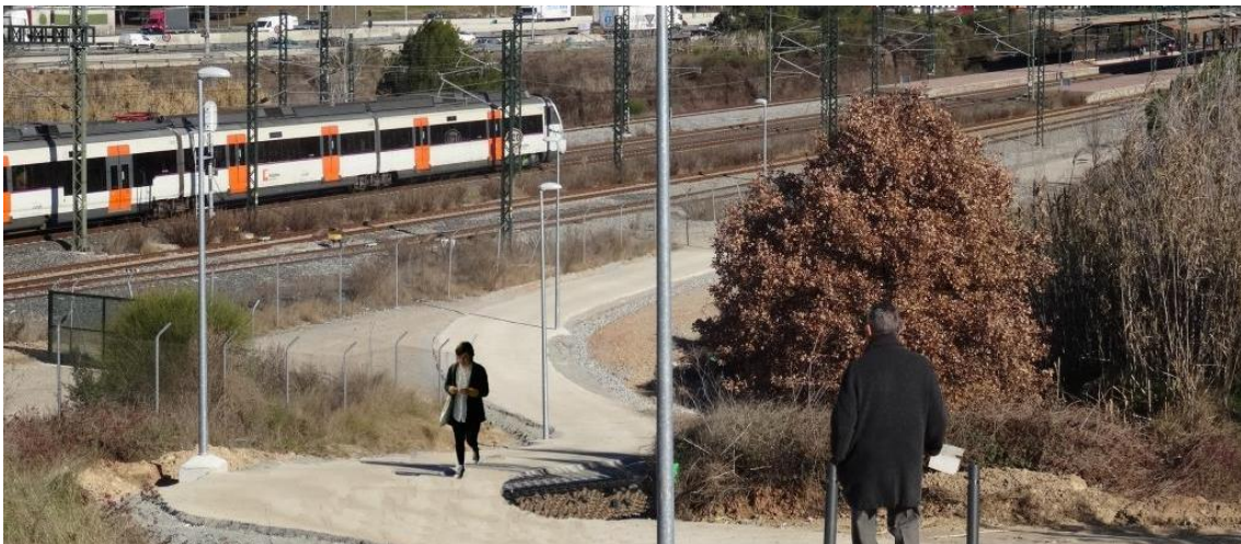
Pedestrian and cyclist access from Cerdanyola Universitat railway station (10 minutes)

Parc de l'Alba – BSP recently completed the construction of a new paved and lit access path that allows pedestrians and cyclists that arrive by train at the Cerdanyola Universitat train station to walk to the park in 10 minutes.