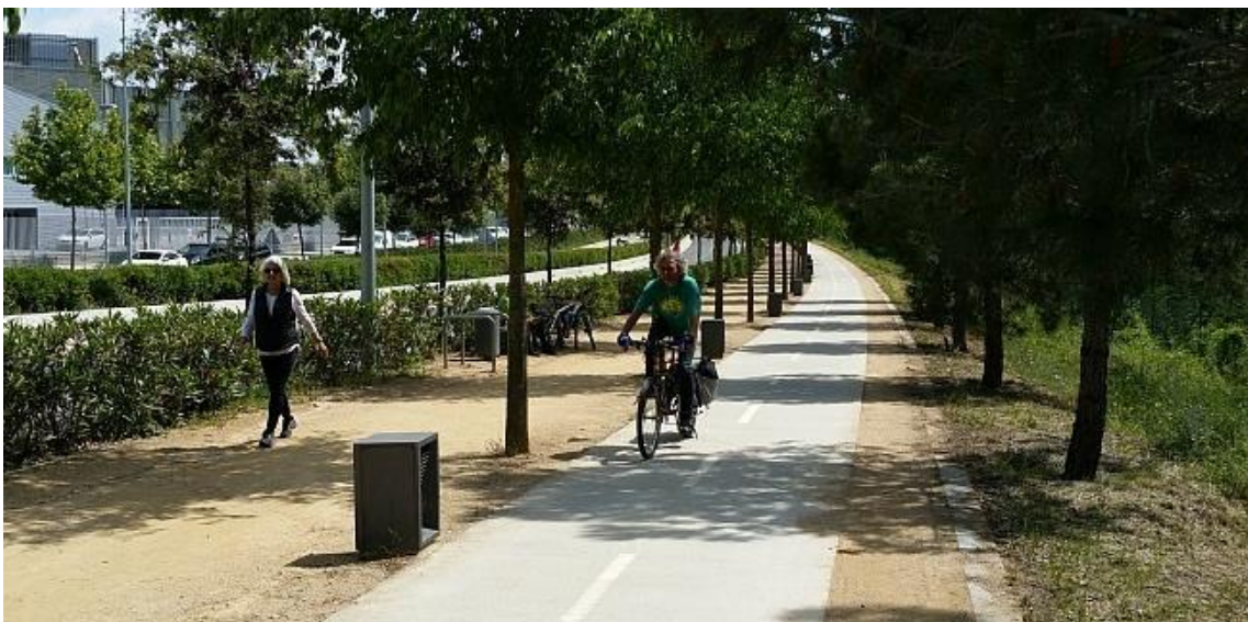
Bike path in Parc de l'Alba – BSP in the direction of Sant Cugat