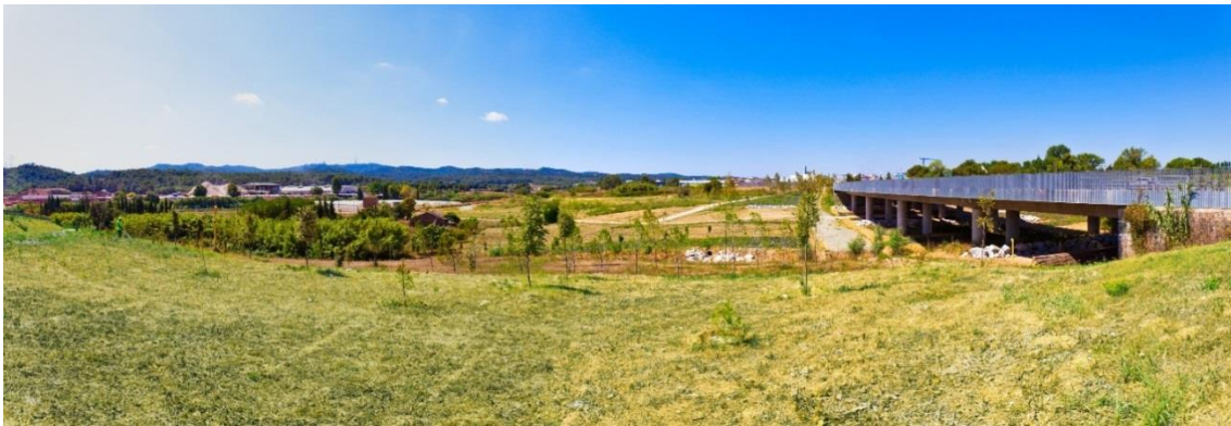
Cerdanyola-Sant Cugat BP-1413 road and its wildlife crossings (to the right)

From the very first design, urban planning has defined a harmonious ensemble where business and residential areas share a common space with crops, watercourses and woods, including a preserved large ecological connector : among other actions, two wildlife crossings were built across the renovated Cerdanyola-Sant Cugat BP-1413 road to Parc de l'Alba – BSP.